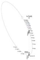
View of HD80606b's orbit