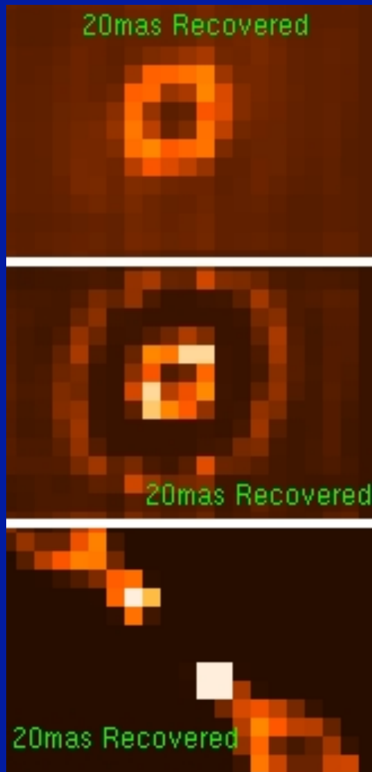
Simulated Performance of the Magellan AO System

At Left: Recovered Circumstellar Disk Morphologies with the Magellan Adaptive Secondary AO System